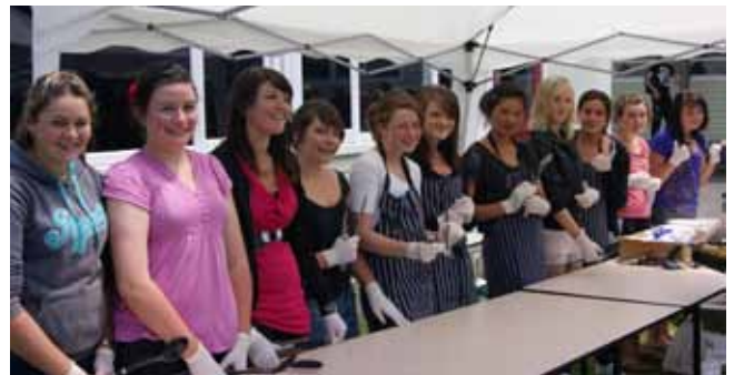
The netball girls getting ready to serve up at last year's Hangi fundraiser