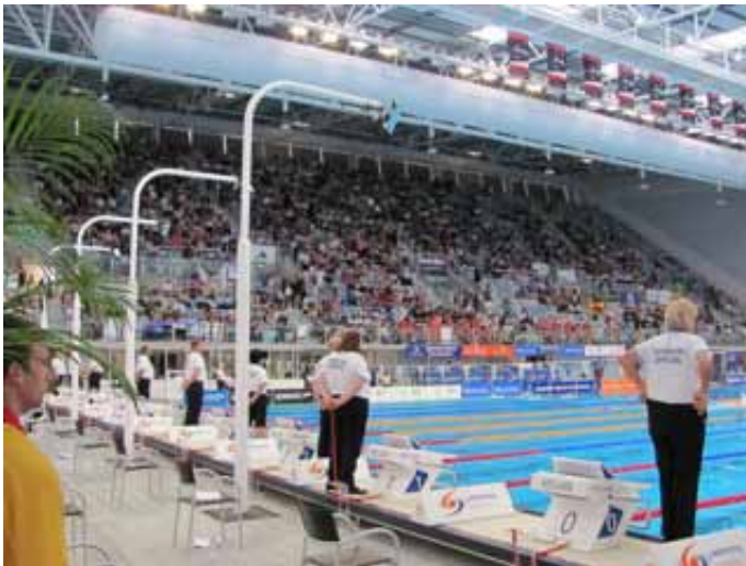
The crowd attending the 2011 Australia Age Group Championships in Adelaide